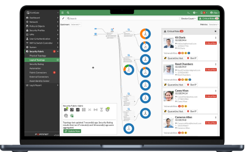
Intuitive easy to use view into the network and endpoint vulnerabilities