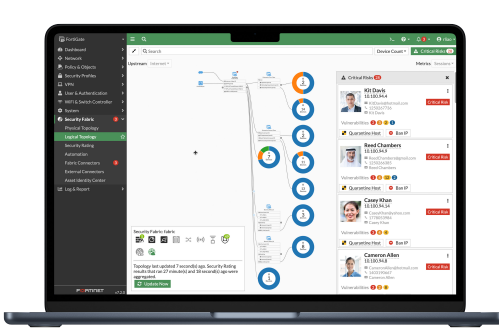
Intuitive easy to use view into the network and endpoint vulnerabilities