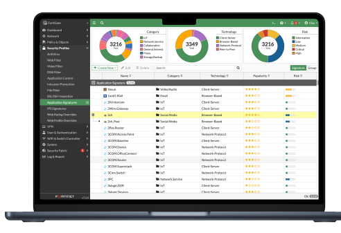
Visibility with FOS Application Signatures