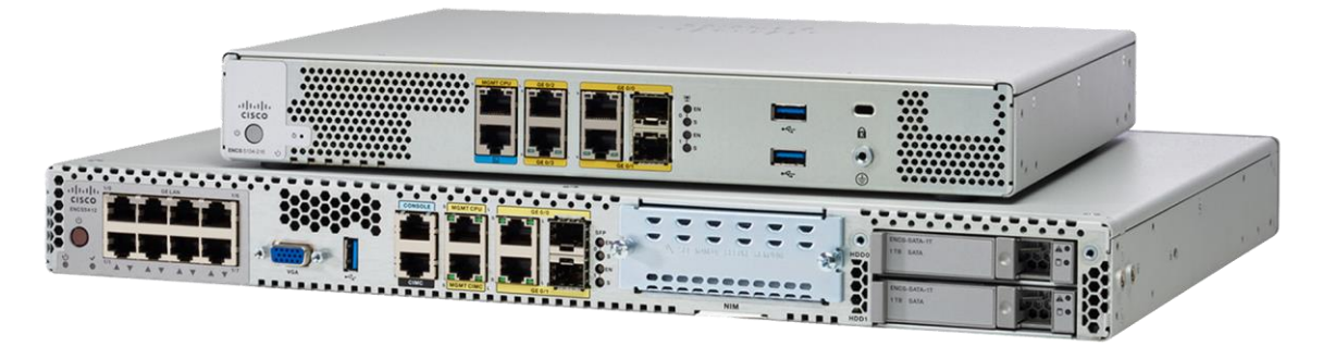
Figure 1. Cisco 5000 Enterprise Network Compute System Family

Figure 1 shows the Cisco 5000 Enterprise Network Compute System family. The Cisco 5400 ENCS (bottom) consists of three models: the 5412, 5408, and 5406. The Cisco 5100 ENCS (top) consists of one model: the 5104. It is available in three storage-capacity variants (64G, 200G, and 400G).