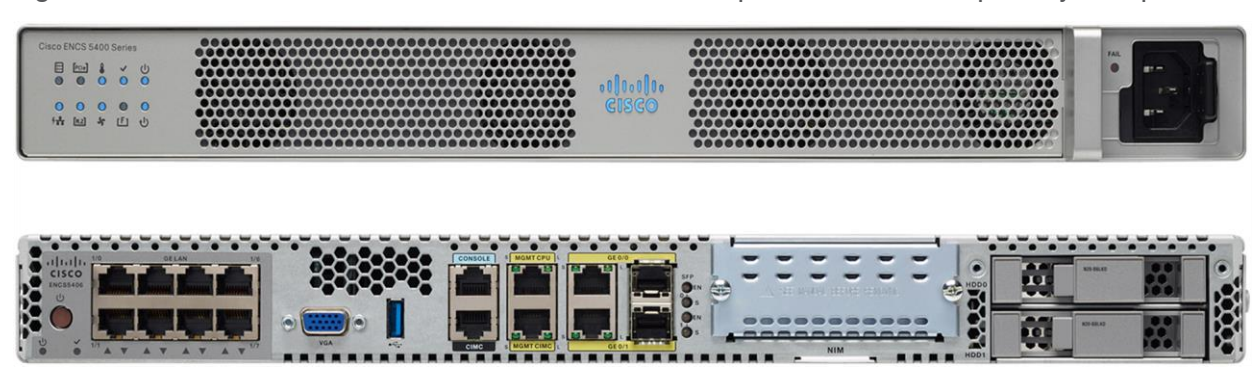
Figure 3. Cisco 5400 Enterprise Network Compute System - Front And Back

Figure 3 shows the front and back of the Cisco 5400 Enterprise Network Compute System platform.