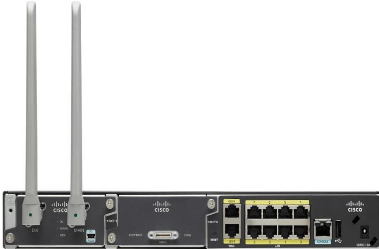
Figure 3. Cisco 800M ISR (C841M-4X) with WIM-3G and WIM-1T