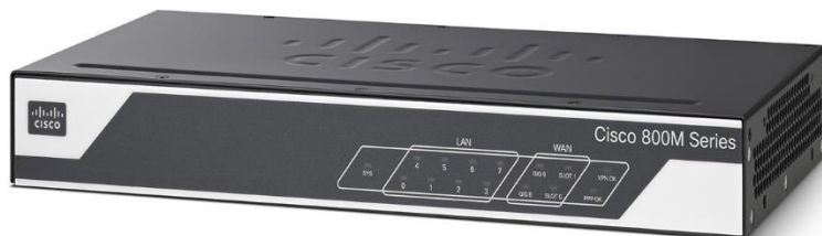
Figure 1. Cisco 800M ISR (C841M-8X)

The Cisco 800M Series platform supports pluggable Cisco WAN Interface Modules (WIMs) for flexible connectivity.