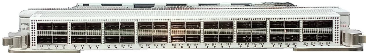
Figure 4. Cisco NCS 5700 Series 36 port 100 GE Scale Line Card

The ports on NC57-36H-SE are segregated into quad groups and 4 ports in a sequence form a quad group (ports 0-3, ports 4-7, ports 8-11 and so on form a quad group). Within a quad group, a combination of 40GE and 4x10GE optics or a combination of 4x10GE and 4x25GE is not supported. There is no other restriction on any combination of optics within a quad group.