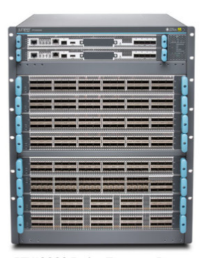
PTX10008 Packet Transport Router