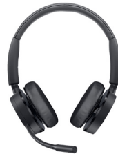
Dell Pro Wireless Headset - WL5022

Get immersive productivity on a 34" WQHD curved monitor with a wide color coverage and extensive connectivity including RJ45, USB-C and quick-access front ports.