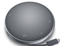
Dell Mobile Adapter Speakerphone - MH3021P

Get productive with a quiet, full-size keyboard and mouse combo with programmable shortcuts and 36 months battery life.