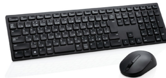
Dell Pro Wireless Keyboard and Mouse - KM5221W

Protect your laptop from impact with this earth friendly backpack that is lined with EVA foam cushioning. Easily convert from backpack to briefcase mode and travel with ease.