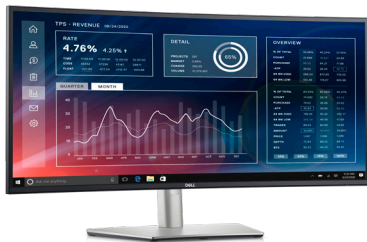
Dell UltraSharp 34 Curved USB-C Hub Monitor - U3421WE

Get immersive productivity on a 34" WQHD curved monitor with a wide color coverage and extensive connectivity including RJ45, USB-C and quick-access front ports.