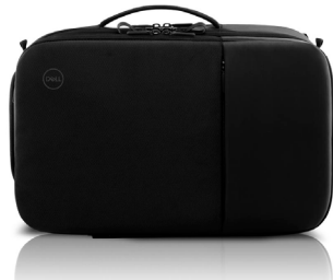
Dell Pro Hybrid Briefcase Backpack 15 - PO1521HB

Boost your PC's power on the world's first modular Thunderbolt 4 dock with a future-ready design