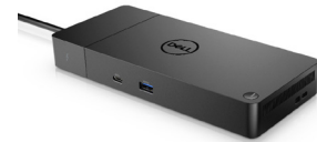
Dell Thunderbolt 4 Dock - WD22TB4

Work from anywhere with this Bluetooth Teams certified headset that lets you switch seamlessly to your PC or smartphone and enjoy crystal clear audio on the go.