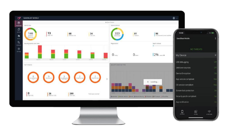
Harmony Mobile Management Console

Easy to manage: a cloud-based and intuitive management console provides the ability to oversee mobile risk posture and set granular policies. Harmony Mobile also expands your mobile application deployment security by giving administrators an application vetting service, allowing them to upload or link applications (both Android or iOS) into the Harmony Mobile Dashboard and receive a full app analysis report within a few minutes.